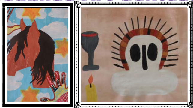
Two of the Art Contest entries in progress.

Some community members have already started painting to enter the Broome Diocese Jubilee Art Contest. The theme is "Spirit Of The Kimberley". The school has offered to provide canvas and paint. You can choose to paint at school or at home, so come and collect your canvas if you'd like to enter. I will collect entries and send them to Broome on Monday May 16th. 1st prize is $5,000, 2nd prize $3,000 and 3rd prize $2,000.