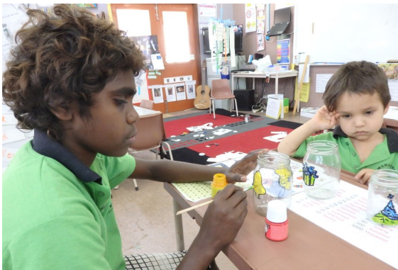
LEFT: Some of the great glass painting students are doing at school this week.

To celebrate this important event we will be having a special prayer service on Tuesday December 8th. Please read next week’s newsletter for further details.